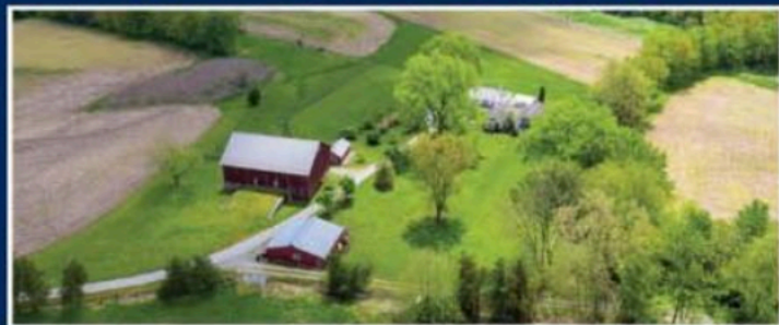
6537 Davidsburg Road, Dover, PA | $999,900

Sotheby's International Realty is a registered trademark licensed to Sotheby's International Realty Affiliates LLC. Each Office is Independently Owned And Operated. Equal Housing Opportunity.