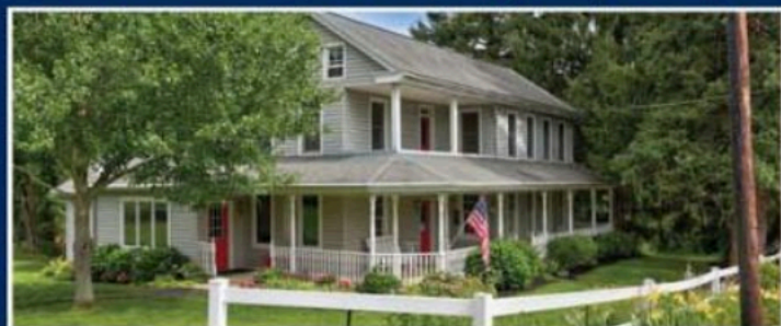
655 Hempfield Hill Road, Lancaster, PA | $495,000