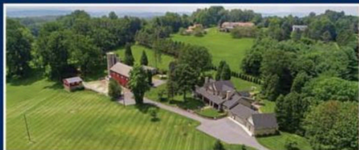
185 Golf Road, Reinholds, PA | $869,900