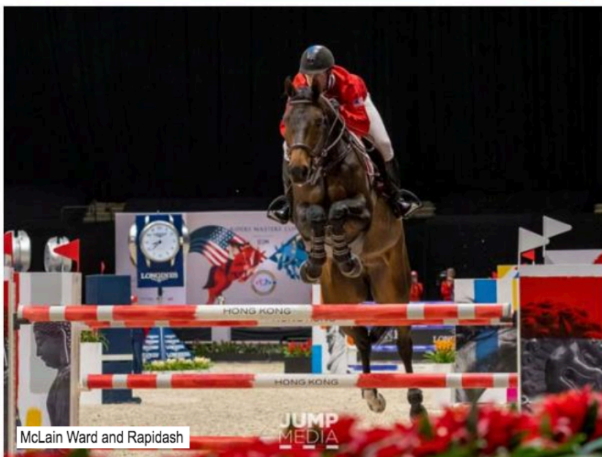
McLain Ward and Rapidash

The Longines Masters 2018-2019 series finished at the Longines Masters of Lausanne on June 20-23. The 2019-2020 season begins again at Longines Masters of Paris on December 5-9 before continuing on to Hong Kong in February 2020 and back to New York in April 2020.