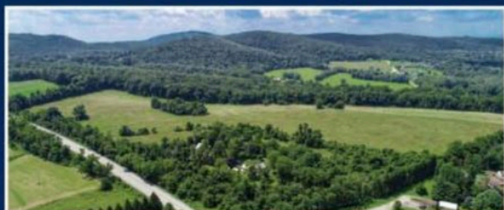
920 Rosstown Road, Lewisberry, PA | $999,950